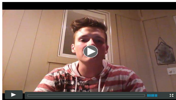
Why Youth Love YPC Events!