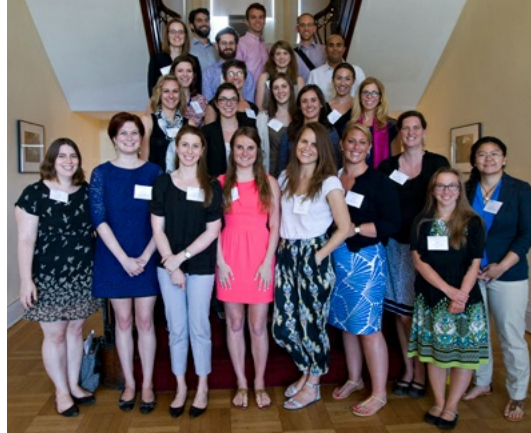
Next Gen Fellows Program Alumni

group-and an expert mentor-to call on for support and ideas.