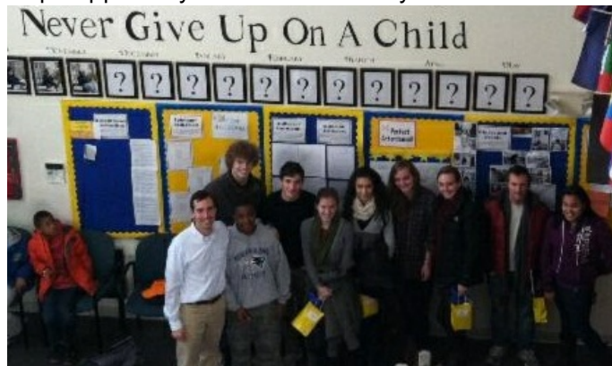
Lumpkin Family Foundation youth on Boston site visit.

This interactive session will highlight youth philanthropy work happening in the Boston area, as well as provide a unique opportunity for foundations and youth in attendance to